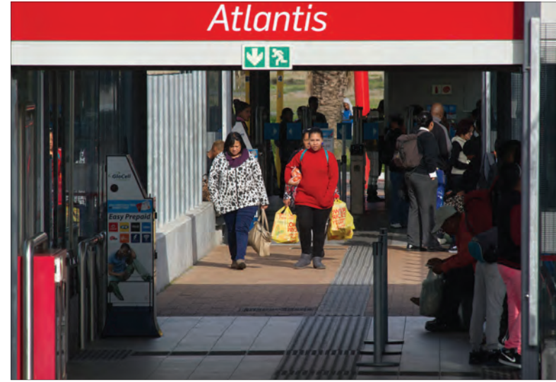
The centrally located Atlantis station is the hub of MyCiTi services. Passengers making the change from Sibanye buses to MyCiTi can get their myconnect cards from the station kiosk.

There are also changes to bus services connecting with Table View, Killarney Gardens, Montague Gardens and central